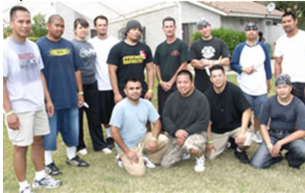
Largo Mano Combat Judo Group