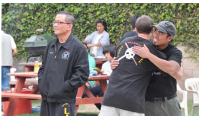
Friendship and Brotherhood