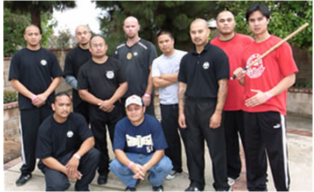
Galius Martial Arts Group