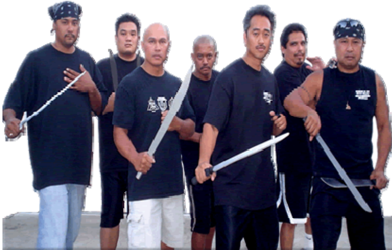
Bahala Na Multi-Style Stockton, California instructors

The Filipino culture is truly applied in the teachings, when one practices they can truly understand how these techniques worked in the jungles in the early years and during World War 2.