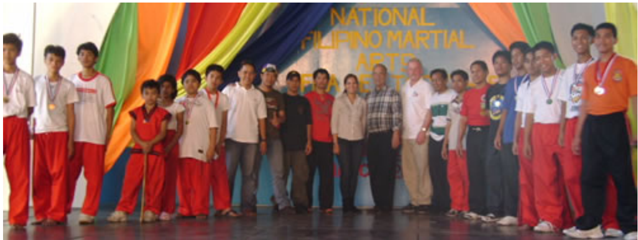
Judges, Referees, and Winners