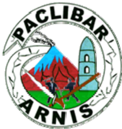
Paclibar Bicol Arnis