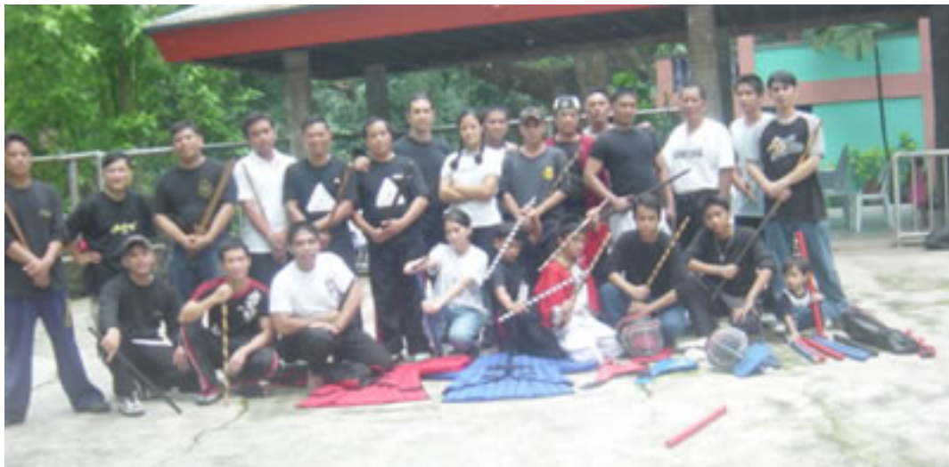
Exclusive Advance seminar held at the Searca International House, UPLB, Los Banos, Laguna, Philippines. June 12, 2006.