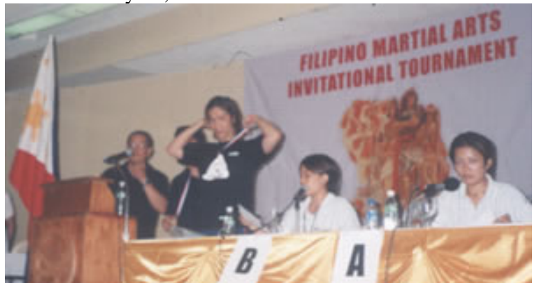
1st Philippine Martial Arts International Invitation