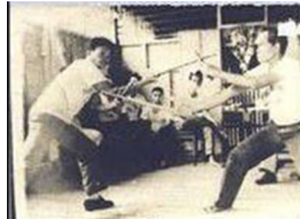
One of the earliest Filipino Martial Arts Clubs.