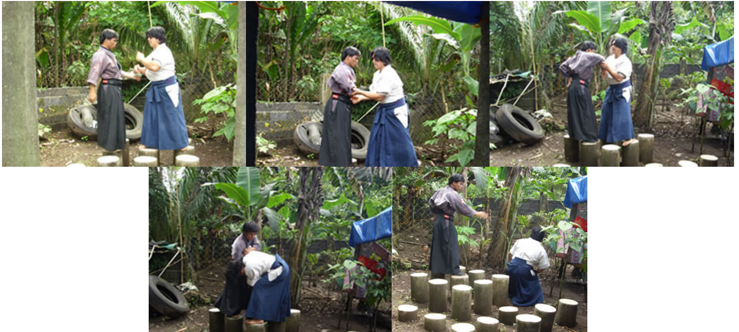
Demonstrating, ground giving techniques on how to move in with multiple opponents in the training of the Plum Flower technique.