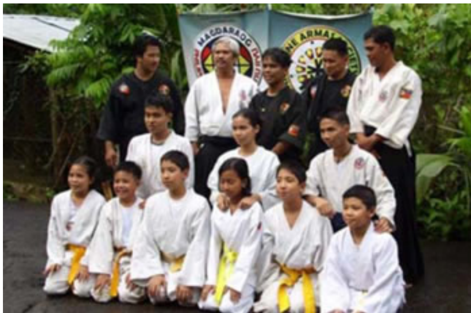
Group picture of the special demonstration: