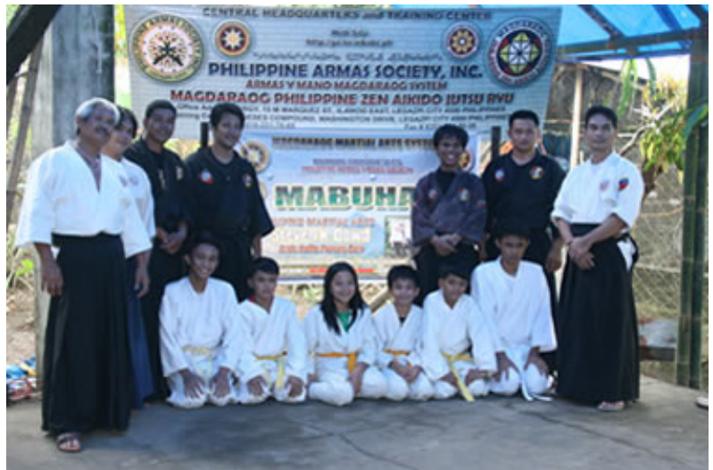
Demo Team and Instructors