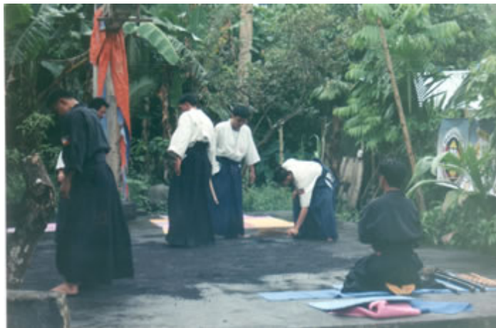
Due to the rain, mats were slippery, so instructors spread dirt on the cement to obtain traction in movement.

On a slab of cement which when thin mats were in place it was found to be slippery, even with no mats and bare cement, it was still rather slick. So the student scattered some dirt on the cement which cut down on the slipperiness, the demonstration commenced.