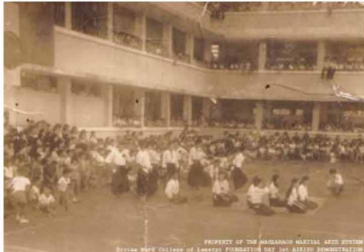
Divine Word College of Legaspi.

In 1964 the Way Aikido Club was established by the Founder comprising of selected students. From the year the Way Aikido Club was established, there were various changes in the name of the organization. Among them is the Bicol Aikido Club, then the Seika-no-itten Aikido Study Center and the Divine Word College Aikido. But the teaching remains the same with the sole objective of making Aikido and effective tool in self-defense.