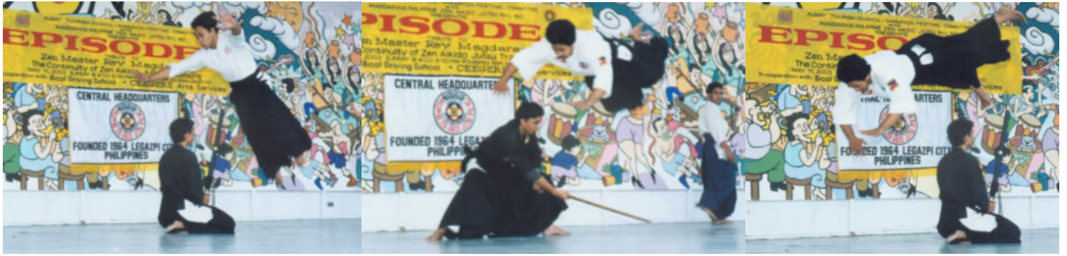
Philippine Armas Society