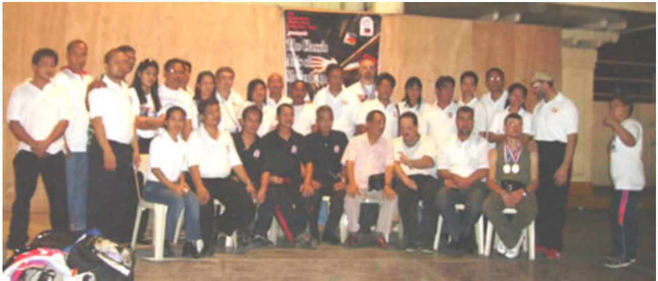
The Officiating panel, IMAFP Officers and the foreign winners