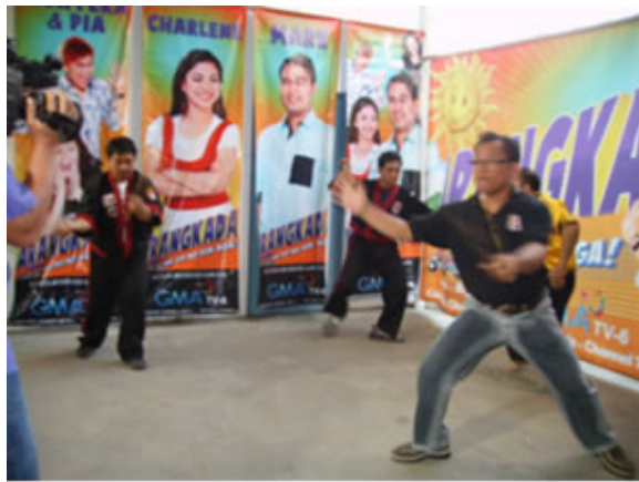
Demonstration at Television Network in Iloilo-GMA 7