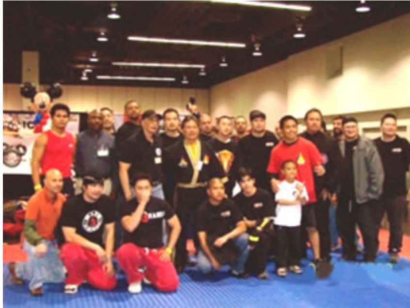
Referee Clinic April 12, 2008 Hayward, CA.