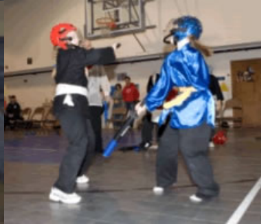
Referee Clinic Stockton, CA. April 15, 2007