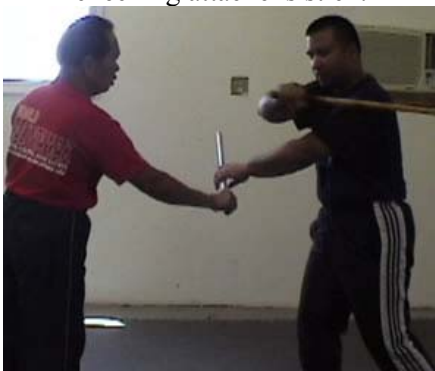
Defender counters with a parry to the right and strikes.