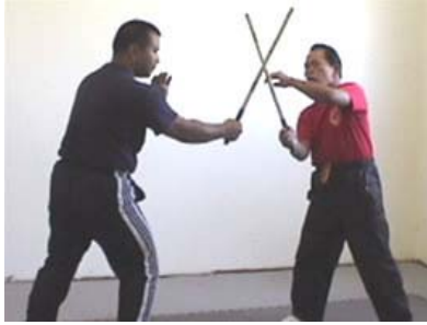
Downward vertical strike to head