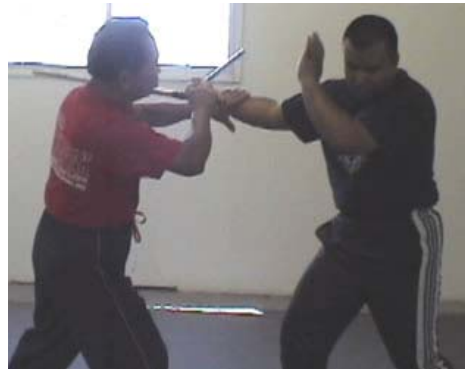
This is a simultaneous block (of the hand/wrist/arm) and strike.