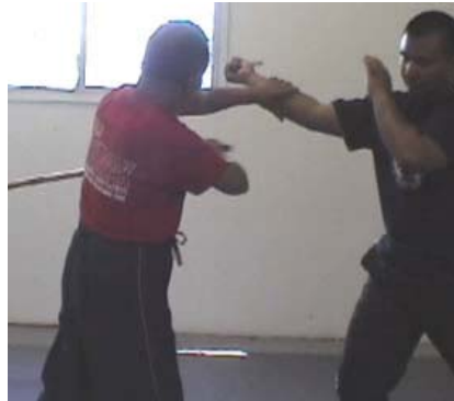
A direct defense and strike to floating ribs.