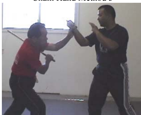
Chain Hand Method 4