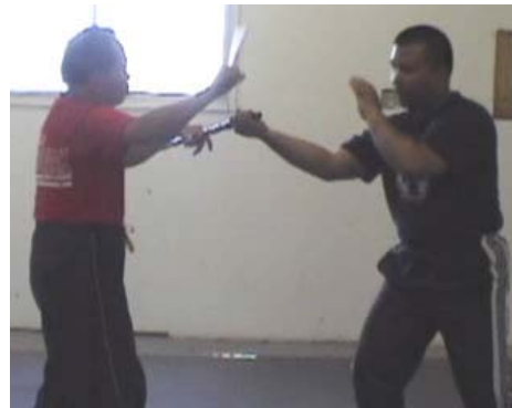
Chain Check Stick Method 1