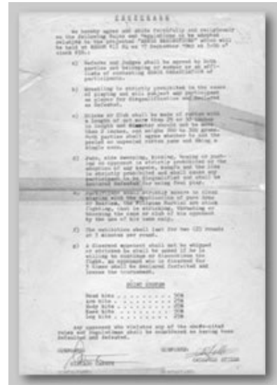
Contract for fight