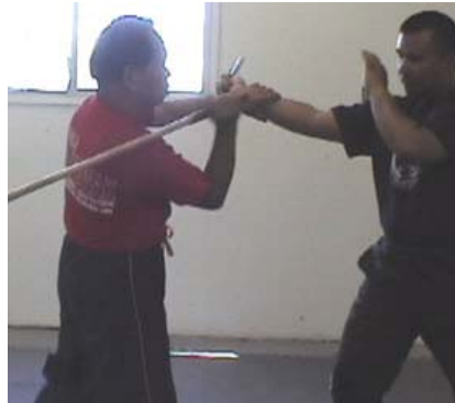
A direct defense and strike to left temple.