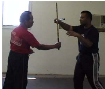
Grandmaster Atillo defend's the strike.