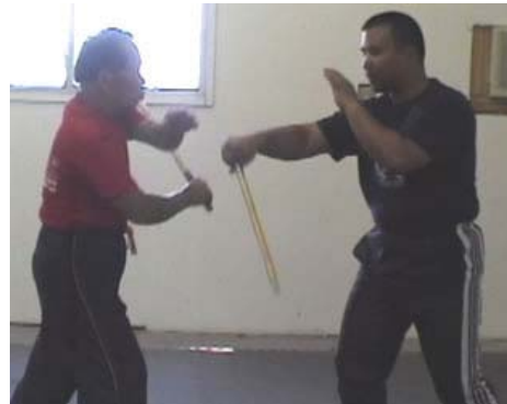
Chain Check Stick Method 4