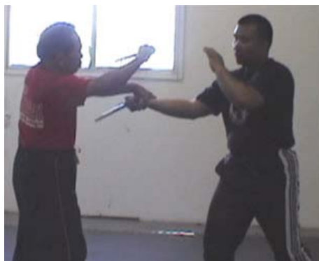
Chain Hand Method 1