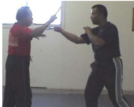
Live hand is ready but not checking as Grandmaster Atillo strikes.