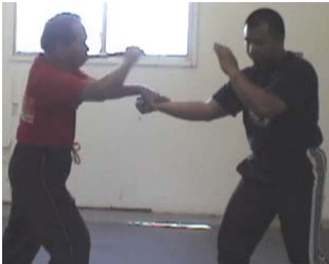
After blocking the stick, Grandmaster Atillo uses live hand to check and control attacker's hand.