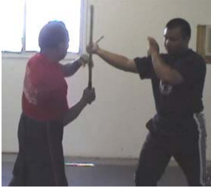
Back on guard.