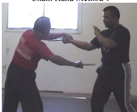
Chain Hand Method 2