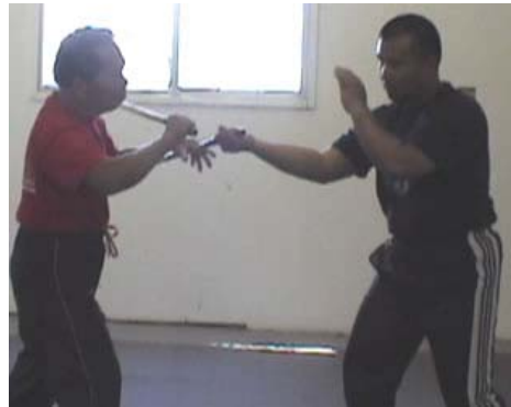
After blocking the stick, Grandmaster Atillo uses his live hand to check and control attacker's stick.