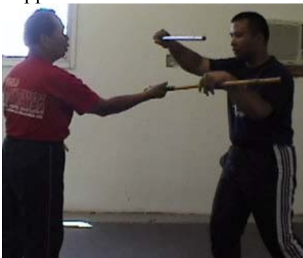
Defender blocks and strikes while checking attacker's stick.

In Step 1, the defender is learning to control the stick in every attack and defense of the opponent.