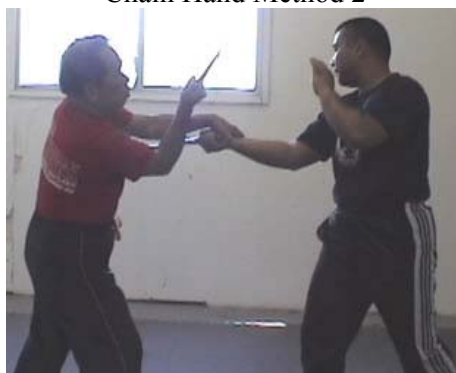
Chain Hand Method 3