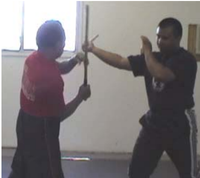
Back on guard.