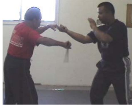
Chain Check Stick Method 2