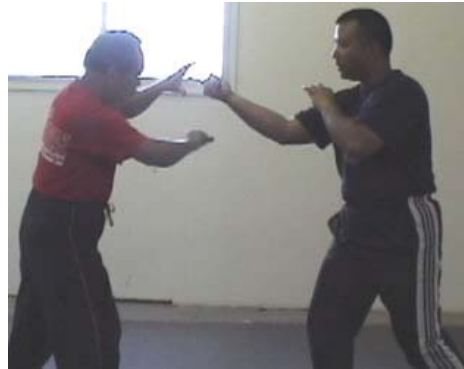
Live hand is ready but not touching stick as strike goes to another quadrant.