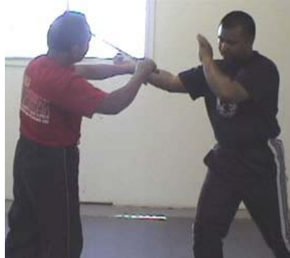
Instead of blocking with the stick, Grandmaster Atillo simultaneously blocks the wrist/arm and strikes to opponent's head.