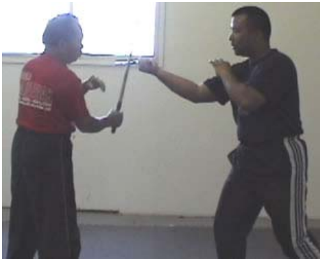
Grandmaster Atillo defends the strike.