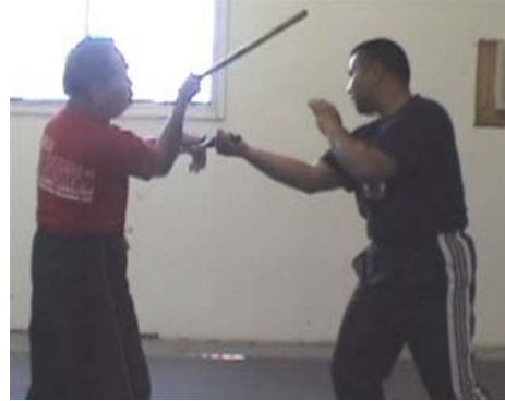
Chain Check Stick Method 3