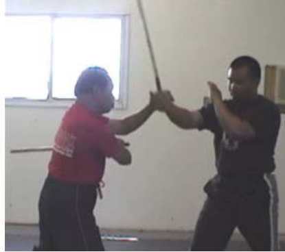
Direct parry and strike to head.