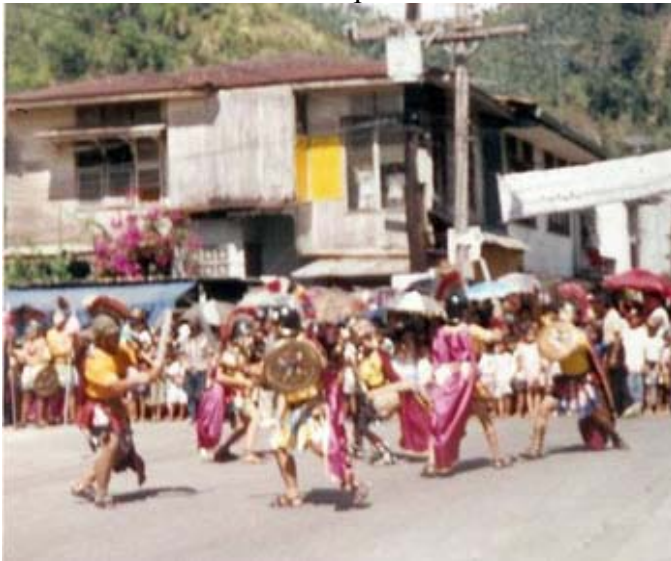
The Centurion Original (formerly Paete Arnis Club 1920)

A play is similar to a Broadway show, showcasing the battle of the Christian against the Moslem Moors, where a mock Battle is the climax of the play. The Filipino used this play as the Propaganda, for their “Mass Revolution” during the recruitment of the “KKK” or short for Katipunan in Luzon Island.