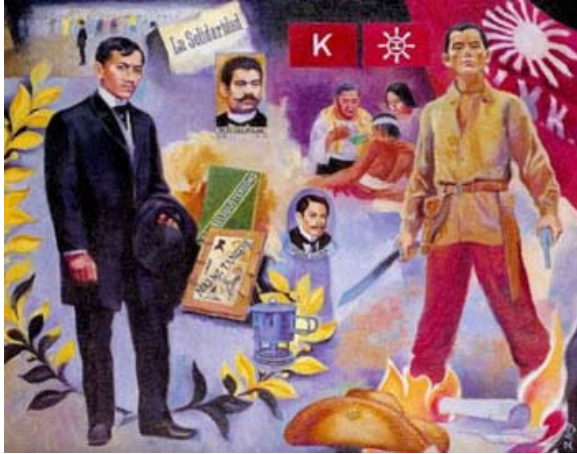
The Philippine Revolution in 1896 (Filipino-Spanish War)