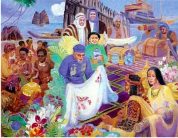
The Early Migration in the Philippines on early 5th up to 13th Century

Philippines consist of 7,100 islands; each island has names that ring with music and dance. Each island has its own unique and wealth in tradition and culture. In this article, I would like to focus and highlights the traditional dances that shows the history, the people, the custom, and tradition, of the Filipino people in motion arts.