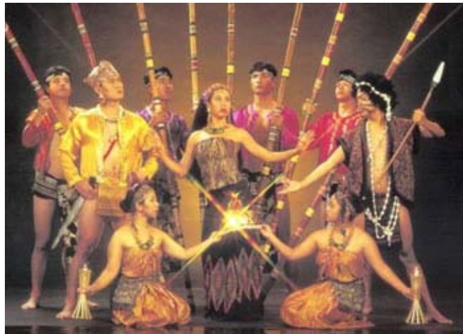
"Gintong Salakot Dance" The historic arrival of Malay to the Philippines

Since the Philippine was once a melting pot in Asia, different Tribal groups migrated and different nations were invaded, conquered, and ruled the islands, and history will self explained how some of the dances are "highlighted" like the war dance as part of their history. But interestingly, due from "chocking" like feeling from the ruler the banning of the practice of the Tribal Art of War, forced the natives to hide the art into the dance sequences. The modern Filipino also adapted the music and step from their