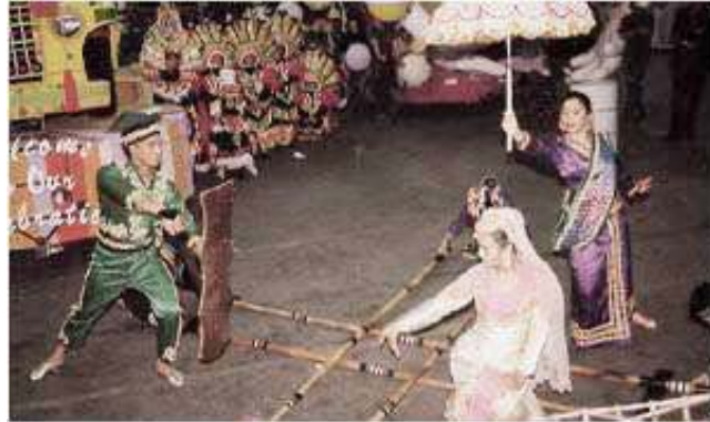
"Singkil" performed prior to the 1997 Rose Parade