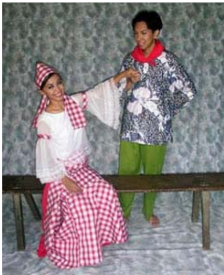
Sayaw sa Bangk