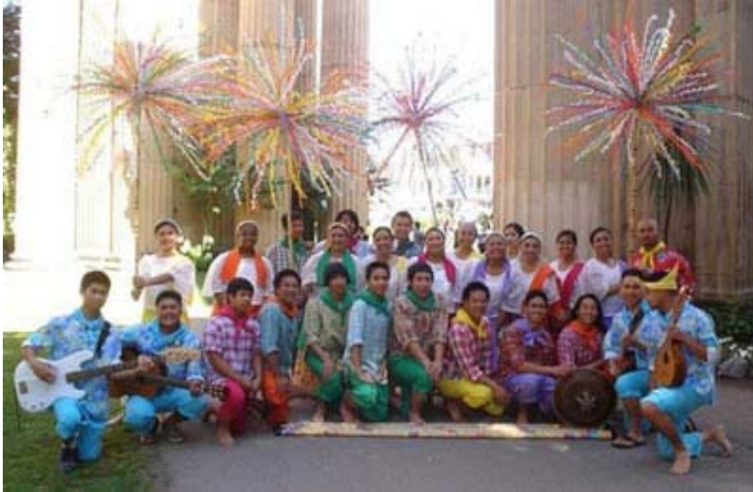
Palace of Fine Arts for San Francisco's 27th Annual Ethnic Dance Festival

Hiyas is comprised of Filipinos of all ages with the majority of them being second generation. Whatever the age or background, all Hiyas members share a love for Filipino folk dancing! Interested in booking a performance or becoming a Hiyas member? Contact us today!