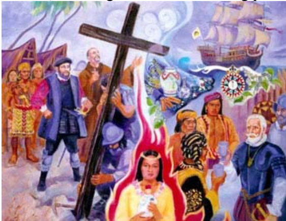
The Arrival of Spaniards 1521

invaders common dances, even the naming of the dance is after the rulers own language. Thus, resulting in a effective hiding place of the practice of the art of war.