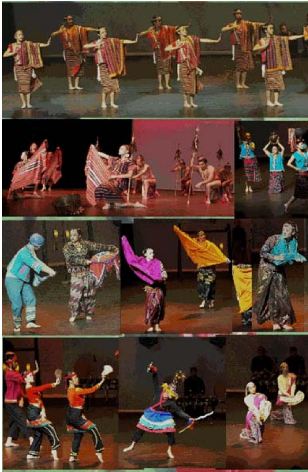
On 13th March 2004, Samahan celebrated their 30th Anniversary.