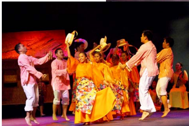
Above photo's from Extravaganza 2004