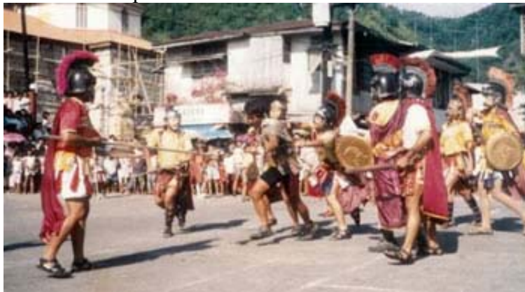
The Centurion Original in Paete Laguna (Formerly Paete Arnis Club 1920)

During the Holy Week celebration in Paete, Laguna, they perform a street play of Moro-Moro called Cinaculo, which is known in other regions as the Moriones Festival. The players are dressed like Roman soldiers and the play attempts to portray the crucifixion of Jesus Christ: Roman soldiers gambling for Jesus’ capture and later for his clothes. The