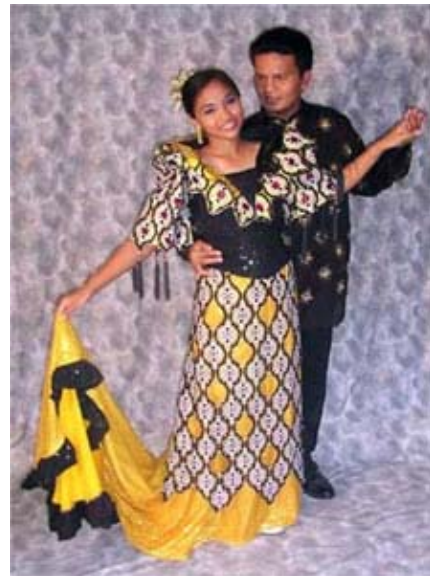
Rigodon de Honor

The group's painstaking efforts paid off when it garnered the overall first place in the following year for the same Nayong Pilipino competition. The success earned them a prestigious rank among the best cultural dance groups in the country. As a result, the CCP invited them again for a solo performance in its annual December Fiesta.