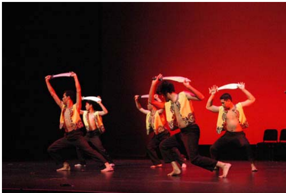
Muslim Kantao Silat