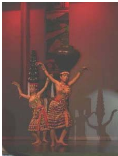
Kalinga Tribal Dance