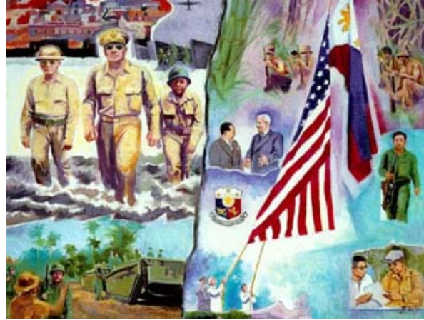
Philippines Liberation from the Japanese occupation (1945)