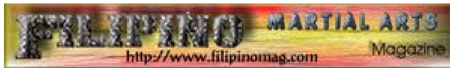
Filipino Martial Arts Magazine