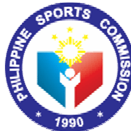
Philippines Sports Commission