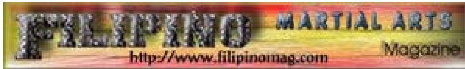
Filipino Martial Arts Magazine

Tanikalang Ginto C.O.M.B.A.T ➤ Arnis ➤ Escrima MartialZone.com Martial Arts Budo Seek - Martial Arts Community