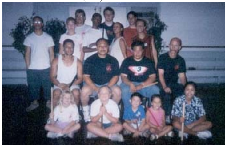
Serrada Stockton Group