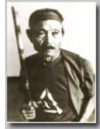
Grandmaster Angel Cabales